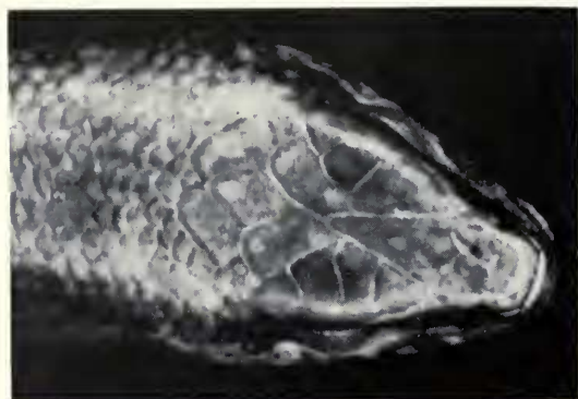
FIG. 3. Sphenomorphus hallieri (FMNH 161486).